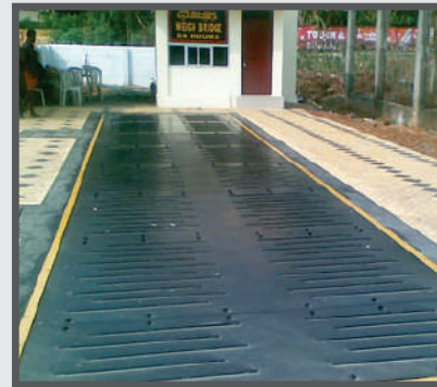
Pit Type Weighbridge