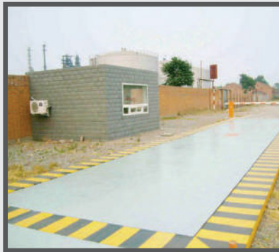
Semi RCC Pit Type Weighbridge