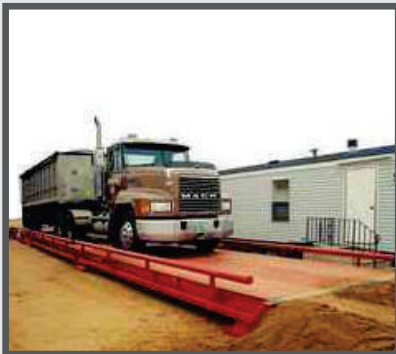
Semi RCC PitLess Weighbridge